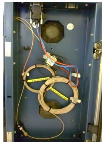
Fig. 1. PQ tubing kit installed in detector oven and connected to flow cell.

For Clarity software, pre-configured PQ method files are available on our website for download.